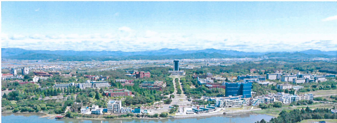
대구대학교 캠퍼스(Daegu University Campus)