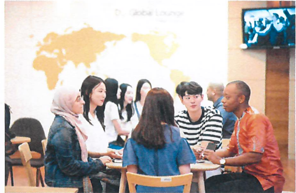
글로벌 라운지(Global Lounge)